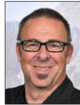
Tim Horton Business Office